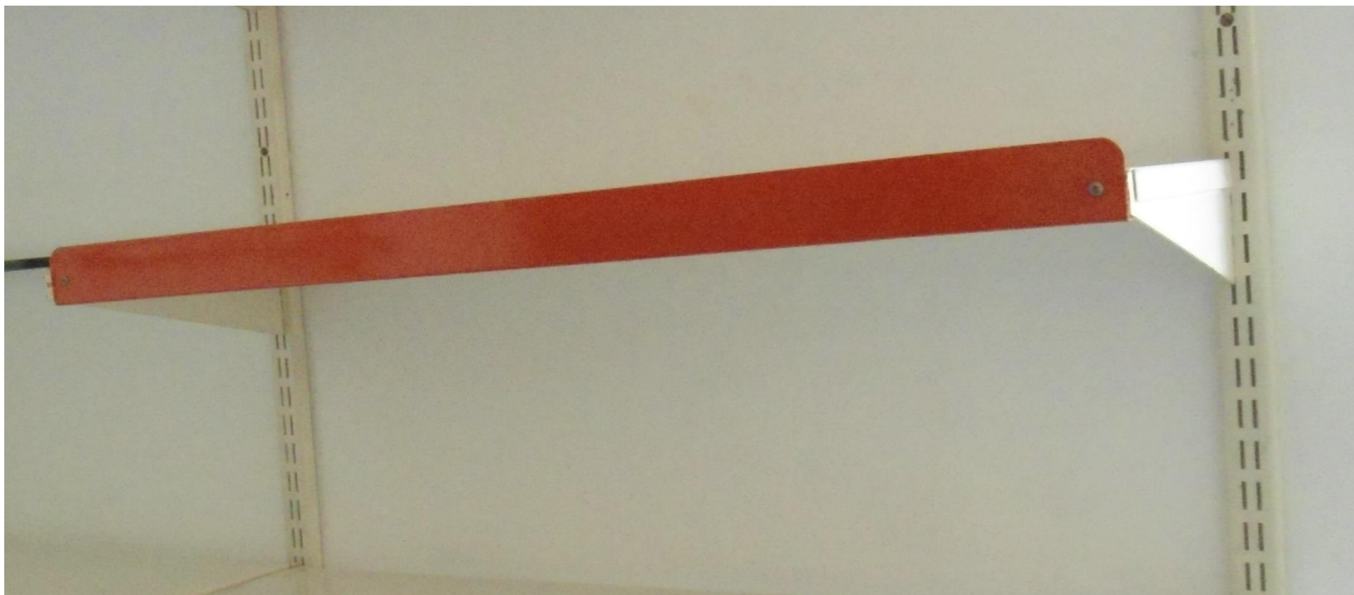
SS Rack with Single channel (For Design Reference only) (Demand item No. 02)