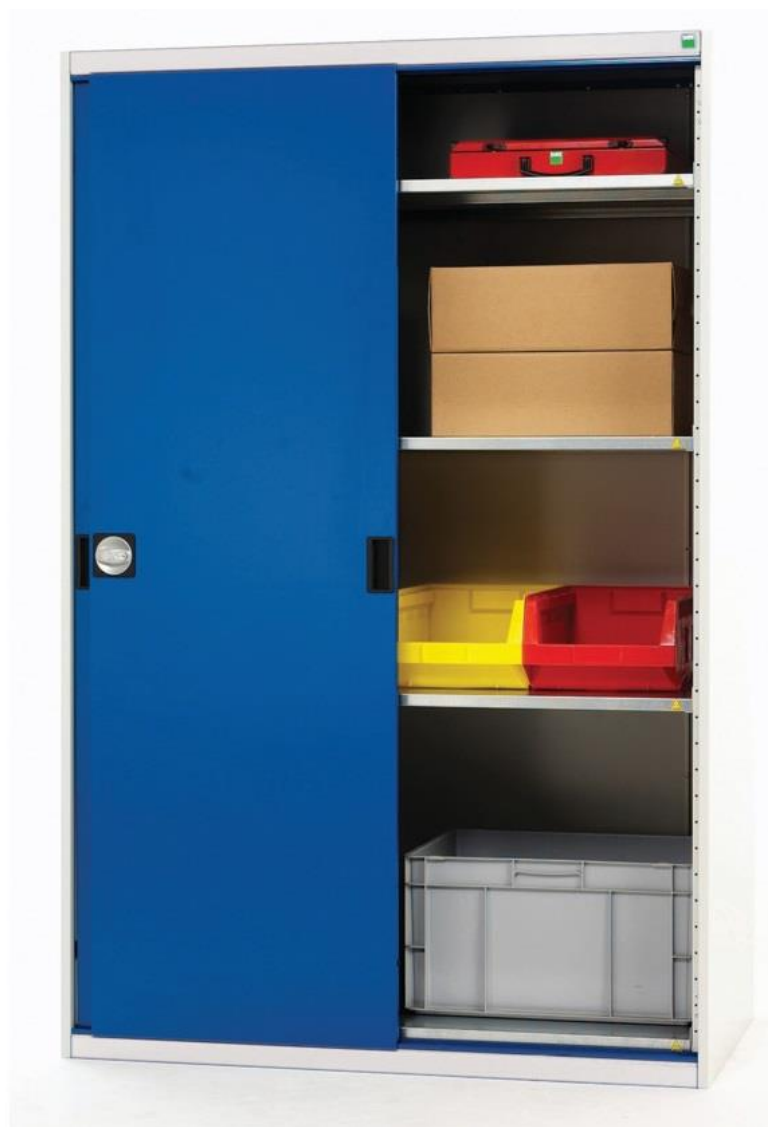
Cupboard for Tools at Lab Store (For Design Reference only) (Demand Item No. 03)